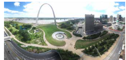
Fig. 2 - At right, the renovated Luther Ely Smith Square leads from the Old Courthouse in downtown St. Louis across a new pedestrian pathway that spans an six-lane highway to the new circular entrance to the Gateway Arch National Park. The $380 million renovation and expansion project took four years to complete.

The multi-phase project, which was completed in July 2018, features a 46,000 square foot addition to the pre-existing visitor center and museum, the complete renovation of the pre-existing 106,000 square foot Museum of Westward Expansion, the construction of a 300-foot wide park extension (fig. 2) over an adjacent highway, flood abatement measures, revised landscaping for the 91-acre park, and the renovation of two major plazas that lead west from the park into downtown St. Louis.