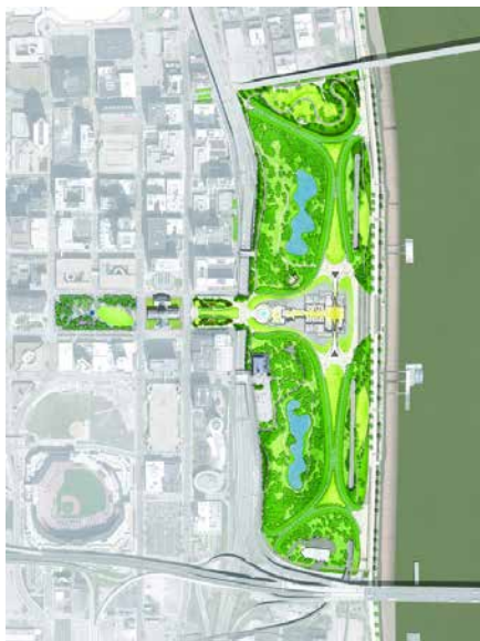
Fig. 1 - A new vision for the Gateway Arch National Park ties the park more directly to downtown St. Louis by means of a 300-foot wide extension over a six-lane highway that previously separated the park from the city. The $380 million Gateway Arch renovation and expansion took four years to complete.

Soaring 630 feet above the mighty Mississippi River and its St. Louis, Missouri, home, the gleaming stainless steel Gateway Arch is the centerpiece of the Gateway Arch National Park and a popular attraction that draws more than three million visitors each year.