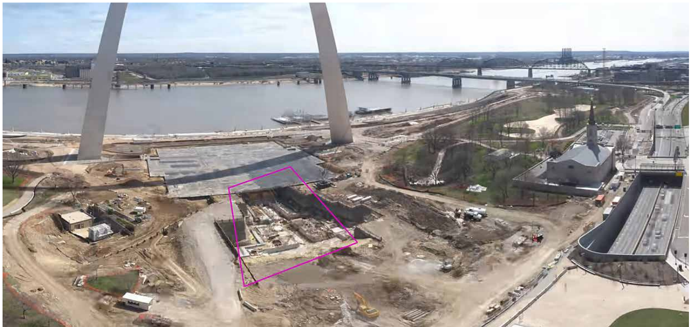
Fig. 3 - Under construction – a 46,000 square-foot expansion to the Gateway Arch Park includes a new visitors center and museum expansion. At this point in the construction, utility tunnels (indicated by shaded area above) were built below publicly accessible areas to provide a pathway for utility lines and to allow workers to move about without entering public areas. The interior of these cast-in-place, below grade concrete tunnels were later treated with Xypex Crystalline Waterproofing Technology.

Built below the publicly accessible level of the new visitor center is a network of mechanical tunnels, measuring 12 feet high, 14 feet wide, and running a total of 550 feet (fig. 3 & 4). The tunnels carry various utilities, including steam and electrical lines, and provide pathways for