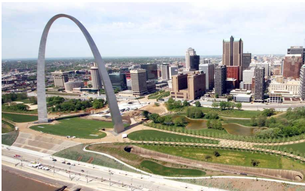
Gateway Arch National Park as seen from the east.