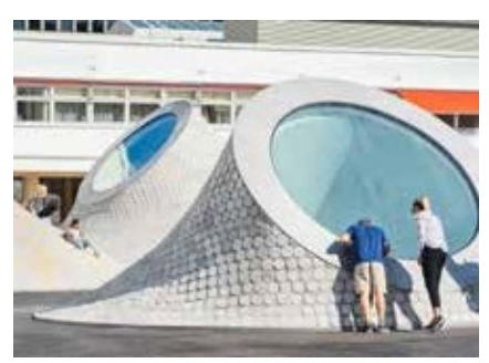
The new Lasipalatsi plaza, now the roof of the new Amos Rex art museum, features five domes of various sizes, each equipped with a large circular skylight. The new city play scape provides an interactive environment that not only attracts the curious, but provides plentiful daylight for the galleries below.

"The project saved money by varying the dosage based on the projected hydraulic pressure at different depths," Ronald Sulin explains. "The water table in that area is quite high. Pumps were used during construction, before concrete was poured, to continually keep water out."