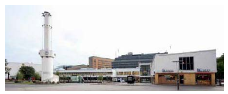
Original Lasipalatsi plaza before Amos Res art museum development.